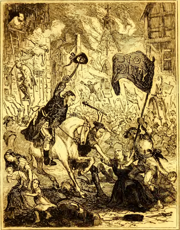
The London Riots.